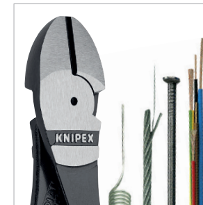
High Leverage Diagonal Cutter

Forged on hinged joint for robust use Hand force is multiplied by 13